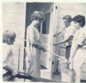
We're all ready for the teacher

After having been closed for two years because a teacher was not available, the Sterling church school has re-opened with an enrollment of 13.