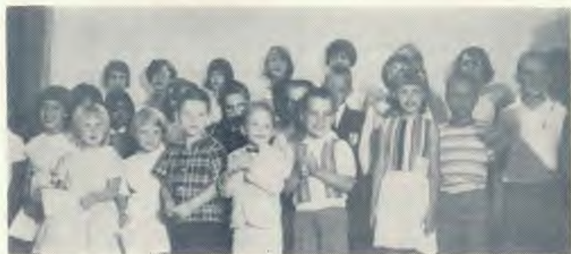
Graduation night with all the students that received their diplomas except eight.

Are you looking for a real thrill in placing the most wonderful literature to be had in the hands of the public? Listen, while I tell you of the experience that has been ours by putting one of our missionary books in a local mo-