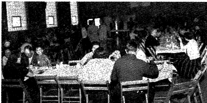
East Pennsylvania Conference workers enjoying a victory celebration banquet in the Kenhorst Seventh-day Adventist School gymnasium on February 28.