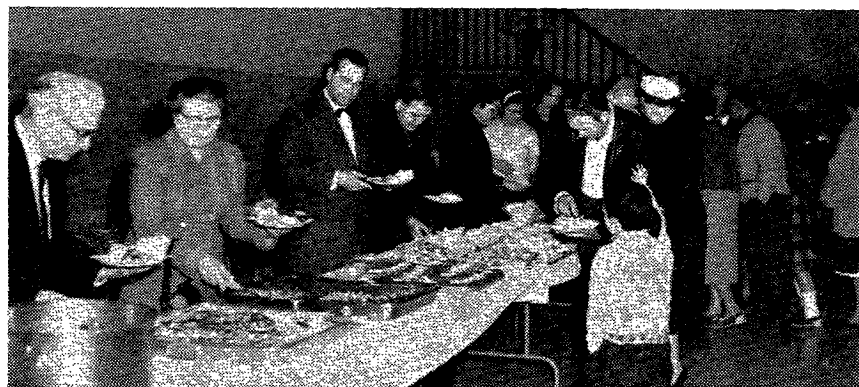
Conference workers fill their plates with delicious food, prepared by the office staff of the East Pennsylvania Conference, at a recent victory celebration of the 1960 Ingathering campaign.

• THE Voice of Prophecy has changed its broadcast time for the York area and can now be heard over Station WORK, the NBC affiliate, from 8:00 to 8:30 on Sunday morning.