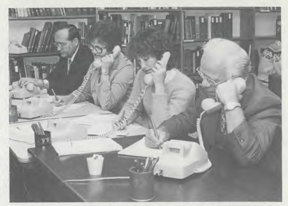
October will be a busy month at the Voice of Prophecy when the Wide Area Telehone Service (WATS) lines will be operating. Last October more than 22,000 calls were received on the toll-free lines.

"My life experiences for almost 50 years have sometimes caused me to doubt the possibility of being an effective Christian. I can truly say that the Voice of Prophecy broadcasts and the New Life Bible course