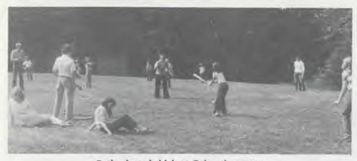
Enthusiasm is high at Galax elementary.