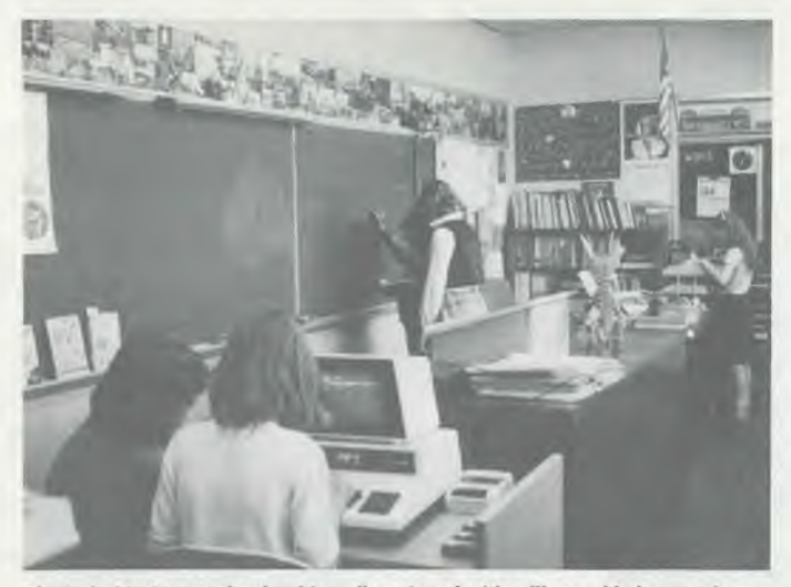
The Irvin M. Comstock school is well equipped with a library, kitchen, and gym. The upper grades classroom even has a PET Computer.

boro church. The building was built by members of the area Seventh-day Adventist churches.