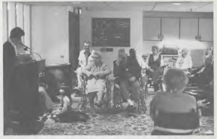
Corsica Hills Nursing Home patients look forward to each Sabbath when they hear a Bible story program.