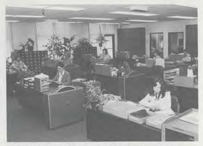
The Voice of Prophecy Bible Correspondence School celebrates 40 years of service this year. Since its founding in 1942, the school has graduated 763,327 persons from its many courses. Each student has the same instructor throughout a course. The ten instructors grade more than 2,000 test sheets a day.