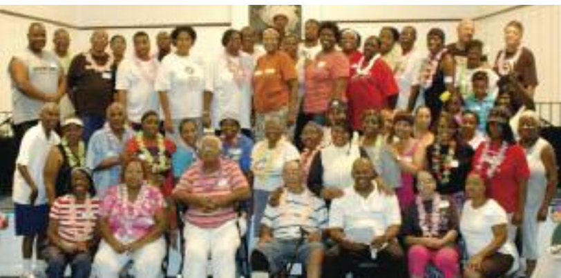
After attending Campostella Heights church's boot camp, these participants saw improved health and wellness.

To help develop their test-taking skills, sophomores, juniors and seniors also spent a Sunday or two, sitting for simulated full-length PSATs/SATs. The freshmen were not left out as they also participate in a program to help them develop and hone study skills and time management techniques. For the sophomores and juniors, this exam determines eligibility for the National Merit Scholarship Program.