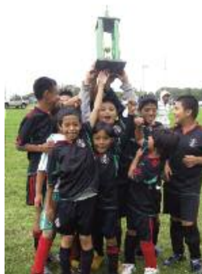
Mexiquenses (above) topped the Panamericana team.

In the young adult division, the Cape May team won over the Victoria team from the Laurel Springs Spanish church. In the teenager division, the Manchester United team (left) from the Bridgeton Spanish church won over the Barcelona team from Panamericana Spanish. The Bridgeton women claimed victory over the Panamerican women. In the children's match, the Bridgeton