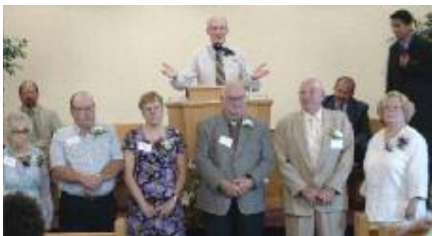
Charter members are recognized during the celebration service.

Chambersburg church members recently celebrated the church's 50th anniversary with a special worship service and afternoon concert. The church was filled with members and friends who enjoyed several musical numbers, a reading of the history of the Seventh-day