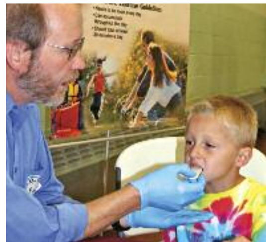
A young boy participates in the dental bite registry at the York church's community health fair.