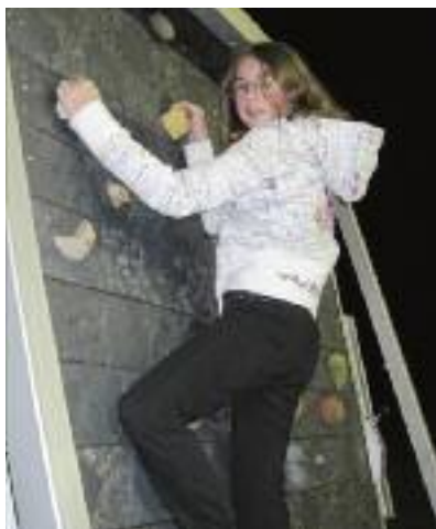
A potential student tests her skills on a rock wall.