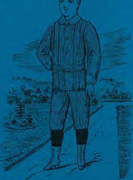
BOY'S NORFOLK SUIT. From $2.00 to $4.00.

100 Boy's Strong Tweed Suits, From $1.80 to $6.00.