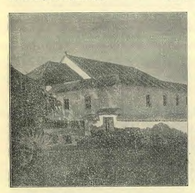
View of the Church Building, Mukkipinkudi, Tinnevelly

After the first greetings were over, and we had time to become better acquainted with these people, our respect for them grew wonderfully.