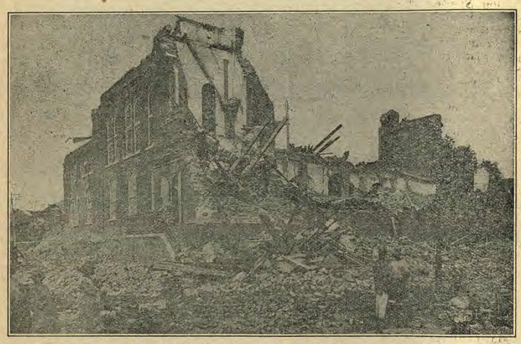
"Earthquakes in divers places."

The earth "shall wax old like a garment" (Ps. 107: 26); "there shall be famines and earthquakes in divers places" (Matt. 24: 7); "the heavens and the earth shall shake." (Joel 3: 16)