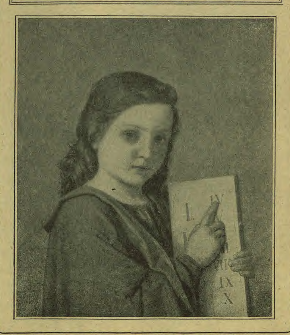
Watchman Publishing Association — MARCH, 1910 — Cristobal, Canal Zone, Panama