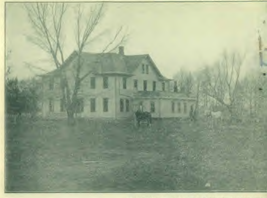
BUILDINGS AND GROUNDS OF THE ELA