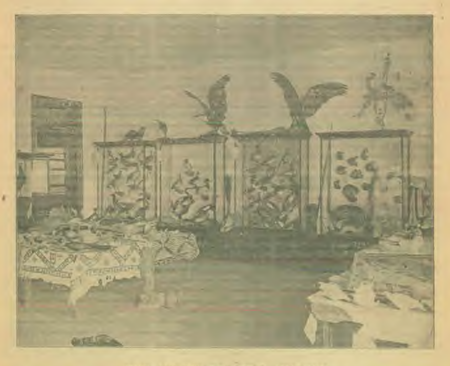
THE UNION COLLEGE MUSEUM