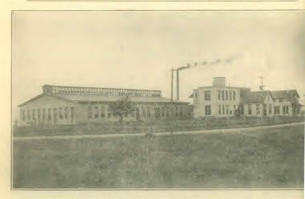
PLANT OF THE SOUTHERN PUBLISHING ASSOCIATION, NASHVILLE, TENNESSEE.

No time is lost in carrying work from place to place, room to room, or floor to floor; and "pi" is seldom served. Electric power is used from the city current and each press is supplied with its own motor.