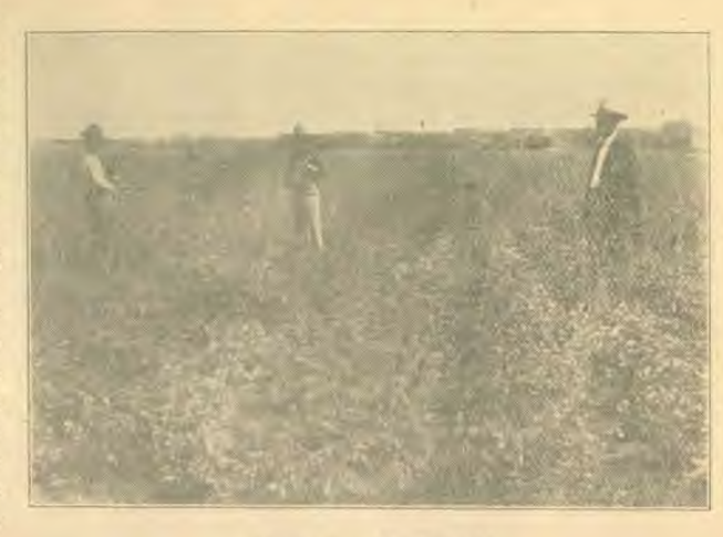
The College Potato Field

field of thirtyacres of the choicest seed corn. It is head high, just tasseling out, without a weed to be seen. We asked the Manager how he succeded in subduing the weeds. He replied that for the first time in his life he feared he would lose his corn crop. The ground was so wet he could not use the cultivator, and the weeds kept on growing. He lay