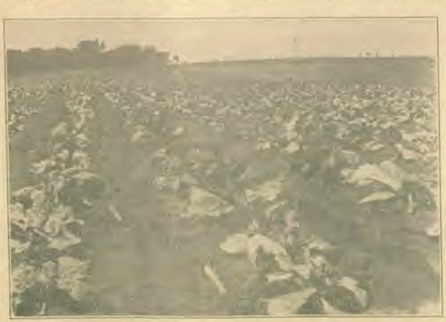
The College Cabbage Patch

ers all from view. Lack of space forbids more than the mere mention of the acre and a half of muskmelons, the acre and a half of peas and beans, the acre of tomatoes, the five acres of corn, the acre of sweet potatoes, and the acre and a half of cabbages. We will give yon however, a glimpse of