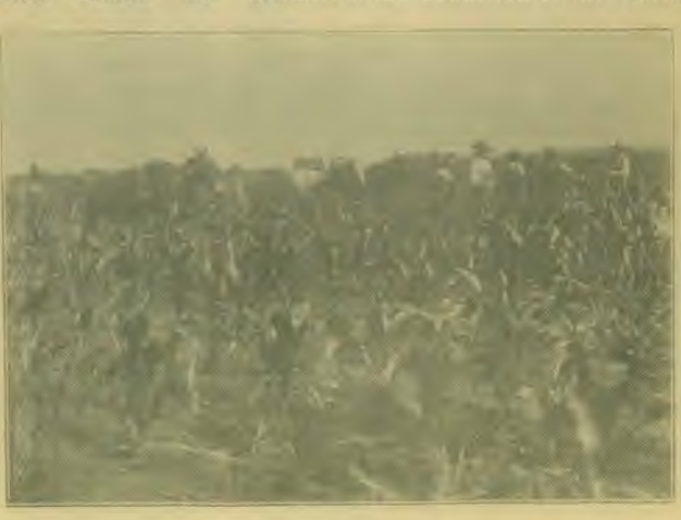
The College Corn Field

Returning from an extended trip lasting several weeks, we are impressed with the splendid condition in which we find the College farm. It has been a hard season to subdue the weeds. There has been so much rain it has been difficult to keep the cultivators running. All over the country may be seen cornfields given over to weeds. In striking contrast is the condition of the College