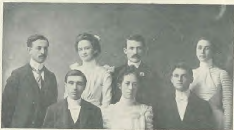
Class of 1900