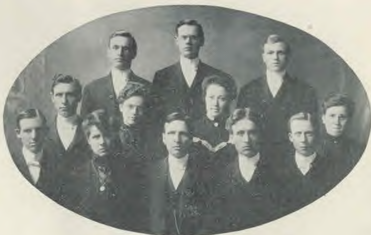
Class of 1904 which organized the Alumni Association