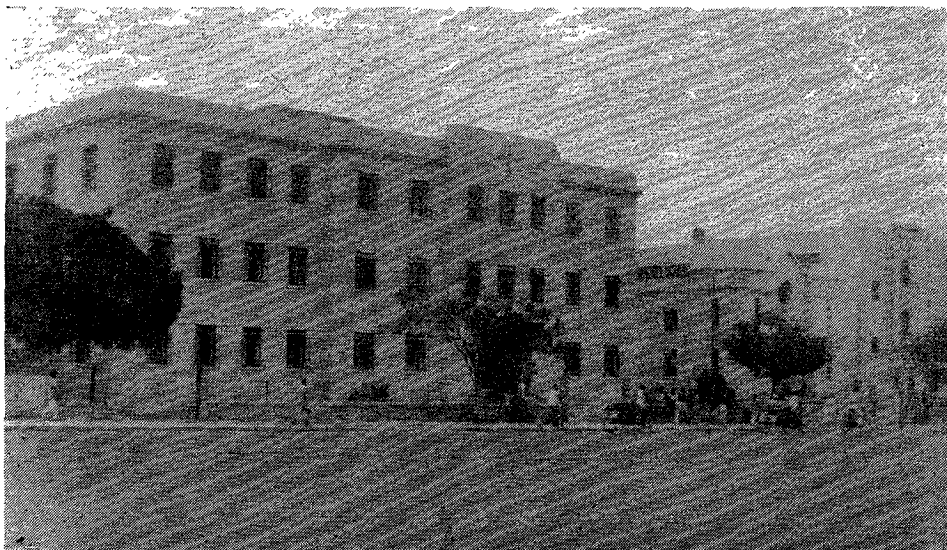
The completed buildings. Hospital to left. Church to right. Residence extreme right.

The site consists of about one acre of land in a desirable part of the city and within easy access. We are happy to have an excellent and well-qualified staff in whose hands the future progress of the institution lies. We wish them heaven's richest blessing in their endeavours to help those in need.