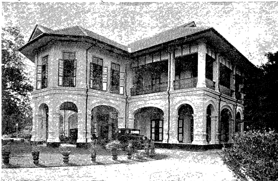
Approach to Division Office From the Right

"We shall have a debt to settle with the Master by and by, when He shall say, 'Give an account of thy stewardship' . . . . He asks a return of the gifts He has entrusted to us, to aid in the salvation of souls. He has given His blood; He asks for our silver."— "Testimonies," Vol. III, p. 390.