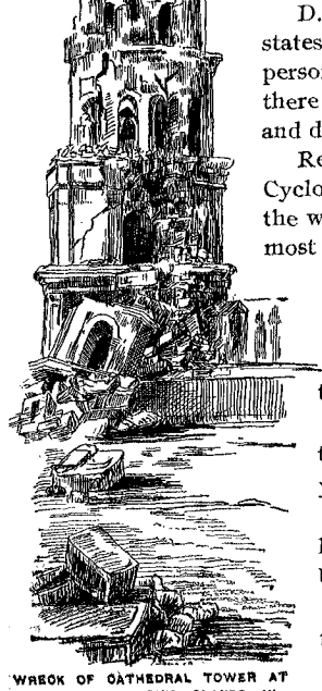
PRECK OF CATHEDRAL TOWER MANILLA, PHILLIPINE ISLANDS, EASTHQUAKE IN 1880.

This earthquake is part of the calamity to be brought in under the seventh plague, as recorded in Rev. 16:17-21. This seventh plague is the last of the seven great judgments of God to be poured out upon the wicked of earth. The next event is the coming of the Son of man in the clouds of heaven.