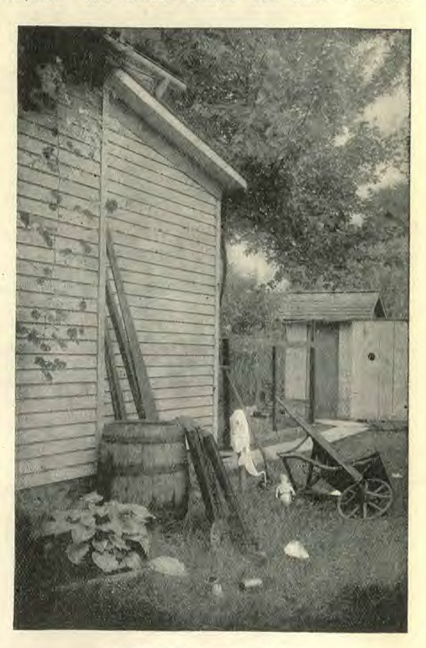
WHERE MOSQUITOES BREED.

Fortunately we are not greatly troubled with mosquitoes in Great Britain; but in the United States and other countries