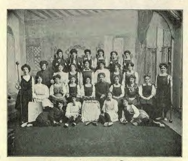
LADIES' CLASS IN PHYSICAL CULTURE.

"HE a beast must die that hath done one good to his country."