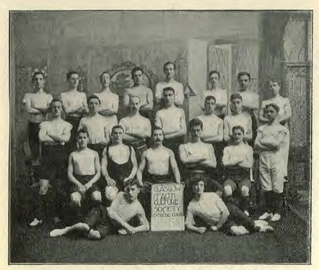
MEN'S CLASS IN PHYSICAL CULTURE.*

are taking into our lungs (presumably to purify our blood!) filth which has been excreted by our own and other people's bodies. This fact cannot be stated too bluntly, for it is at the root of that lassitude, "that tired feeling" (as the quack advertisements say), which signifies a general lowering of the resistant powers of the body and is a direct invitation to disease.