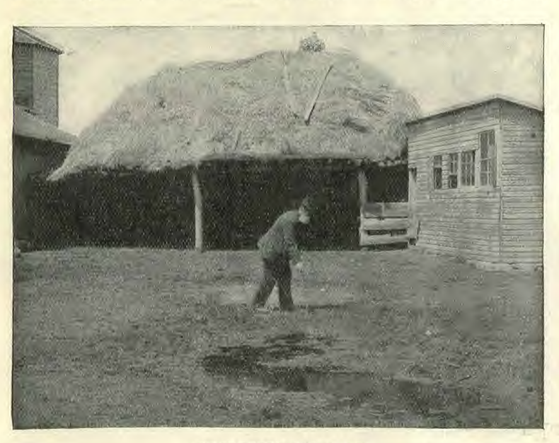
A NEGLECTED BARNYARD.

he is inviting trouble, and he need not wonder if it comes at his bidding. Not Providence, but careless, uncleanly habits and unsanitary house conditions are the causes of a very large part of the disease with which mankind is afflicted.