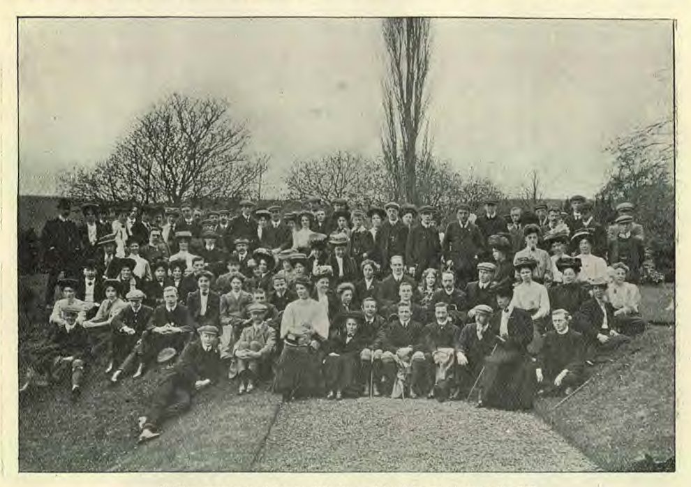
"The country-side ramble is an ideal form of exercise." *

For those upon whom business makes such demands that the mid-day meal is impossible, let there be regularly some strengthening mixture which can be taken in a few minutes between the spells of business. For instance, a dressmaker who cannot find time to sit down to a meal could quite well take an egg beaten up in