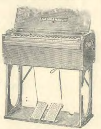
PORTABLE ORGANS Rs. 55 to Rs. 275

Agent for BRINSMEAD, KNAKE ERARD, BECHSTEIN, COLLARD & COLLARD, SCHIEDMAYER STEINWAY, and other first class makers