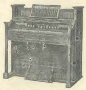
CABINET ORGANS Rs. 150 to Rs. 3,500

of all grades and powers built to order. Estimates free,