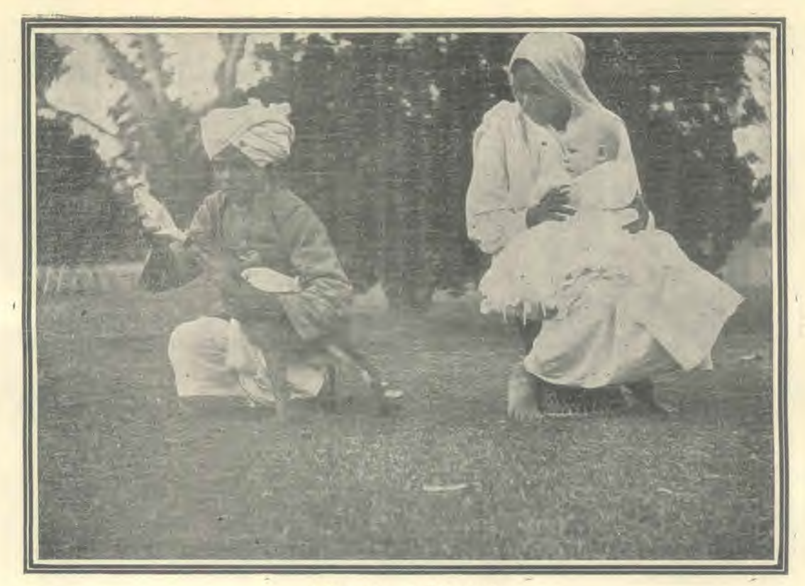
Where's my Bottle?