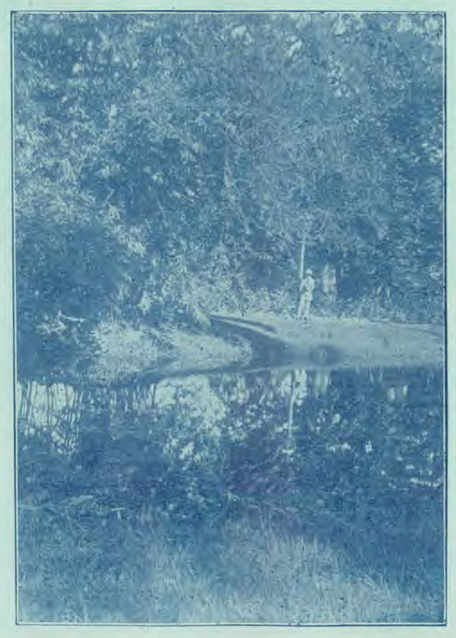
Scene in Eden Gardens, Calcutia.