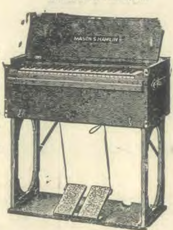
PORTABLE ORGANS Rs. 55 to Rs. 275

By the leading makers specially built for India and supplied on hire, on monthly payments, and on special terms for cash. Rs. 300 to Rs. 4500.