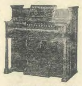
CABINET ORGANS Rs. 150 to Rs. 3,500

of all grades and powers built to order. Estimates free.