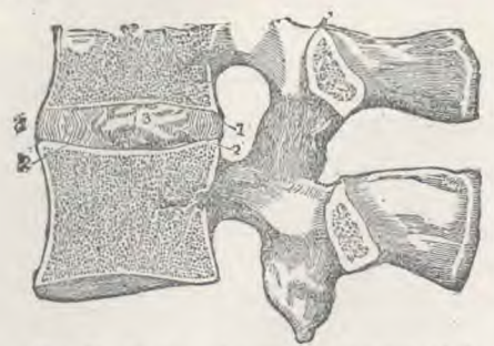
Fig. 31.—Section of vertebra, showing, at 3, Fibro-Cartilage Disc of normal shape.

the elbow upon it. This position is a very common one with students, and to it is due the greater share of the cases of lateral curvature.