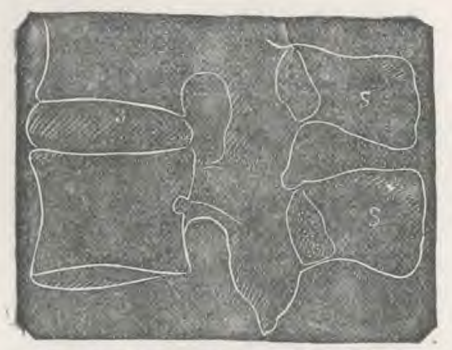
Fra. 32.—Diagram showing the Cartilage, 3, thickened as the result of an anterior curvature of the spine, the spines of the vertebra, ss, being brought near together.