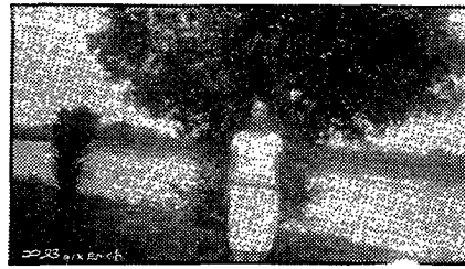
A young teacher in Colombia

"The Lord is coming very soon, and we are entering into scenes of calamity. . . . Let us work now as we have never worked before. We are exhorted to 'be instant in season, out of season.' 2 Tim. 4:2. We are to make openings for the presentation of the truth. We are to improve every opportunity of drawing souls to Christ."—"Testimonies," Vol. IX, pp. 62, 63.