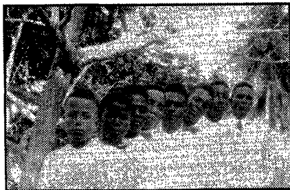
Some of our Missionary Volunteers in the Bahamas