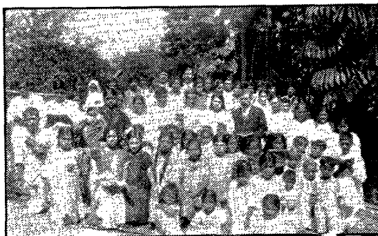
Believers in the Mecapalapa Mountain church, Mexico. Many of these are Indians

This spirit still exists in the hearts of these people today, especially in the smaller places away from the railroad. This week I returned from a visit to one of these places where I had been called. It was a ranch settlement of about 35 thatched-roofed houses out in the mountains some 25 kilometers from the railroad. As the result of the faithful witnessing of one family about thirty had become interested in the Sabbath truth and were calling for someone to come and teach them more fully.