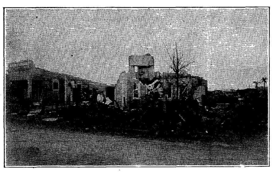
Our church in Santo Domingo City after the hurricane

The official record gives over 3,000 dead and 20,000 wounded. God has