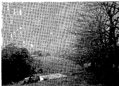
Reservoir at our Spanish training school in Costa Rica

“In civic life they [the Indians] show a remarkable freedom from certain diseases, such as gastric and duodenal ulcers, gall bladder disease, and appendicitis. As regards the latter, I have some figures relating to the relative incidence of appendicitis in Indian and British troops respectively in India. I find that this disease is about ten times as frequent in the British as compared with the Indian army. The rarity of cancer is so striking that a surgeon might practice for many years among this people and never see a case. ”