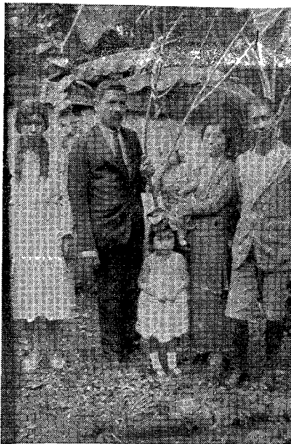
New believers in Ibagué, Tolima, Colombia

"In the closing scenes of the earth's history, many of these children and youth will astonish people by their witness to the truth which will be borne in simplicity, yet with spirit and power. They have been taught the fear of the Lord, and their hearts have been softened by a careful