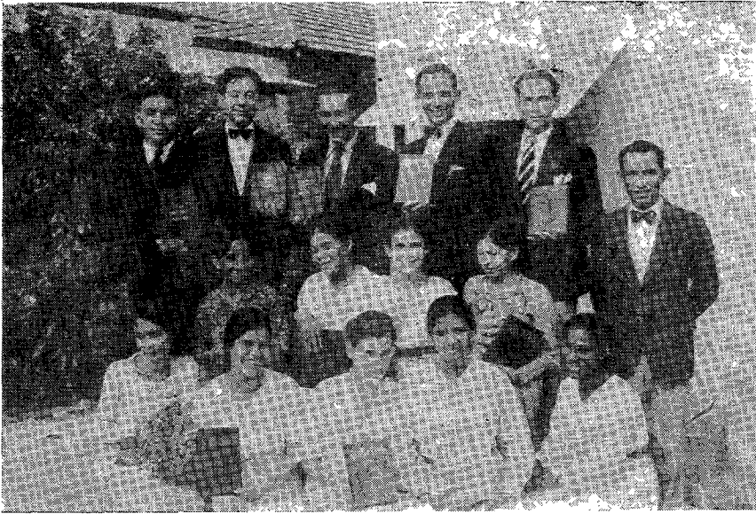
Colporteurs of the Atlantic Colombia Mission.