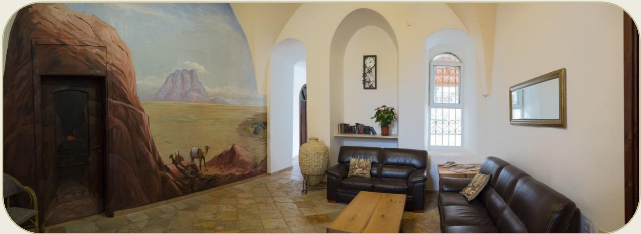
The foyer in the Study Center

The Israel Field will have its own Exhibition Booth during the GC Session with glimpses from the varied activities in Israel, information about our guest-houses, the Hebrew literature ministry and many other things. Please stop by and have a chat, we would love to get acquainted and to catch up with old friends!