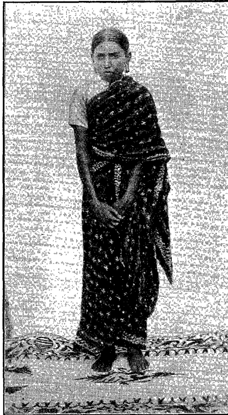
How many Sabbath-schools have someone to equal the record made by this girl, a member of the Nazareth Sabbath-school, who for three quarters was not once absent or tardy?

for the day. This is a good example for all our schools. As yet the membership is small, but we hope that this little light will be fanned into a great flame that will bring light and salvation to many of God's lost sons and daughters in this darkened land,