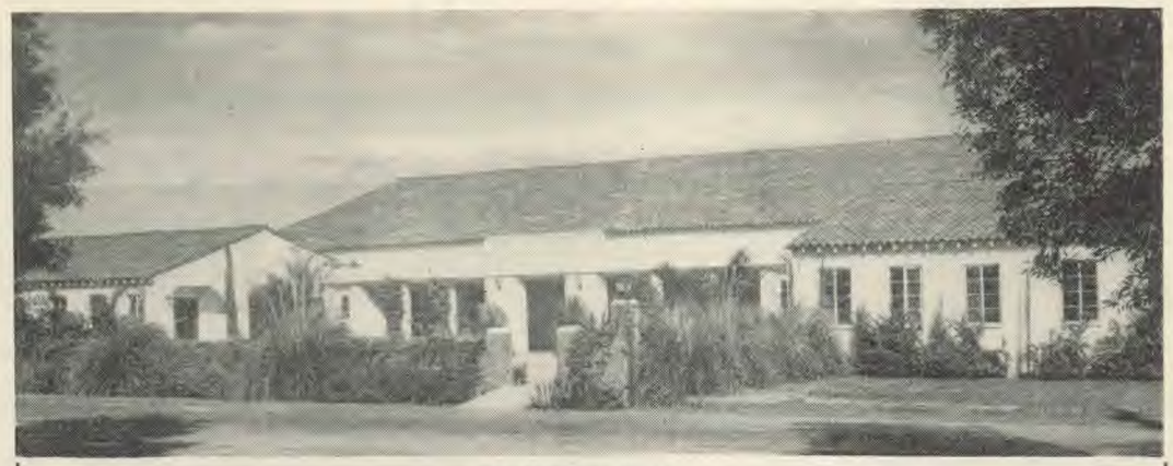
The Cafeteria Building