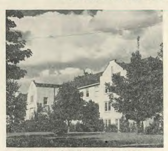
Helen Conard Hall, Women's Dormitory