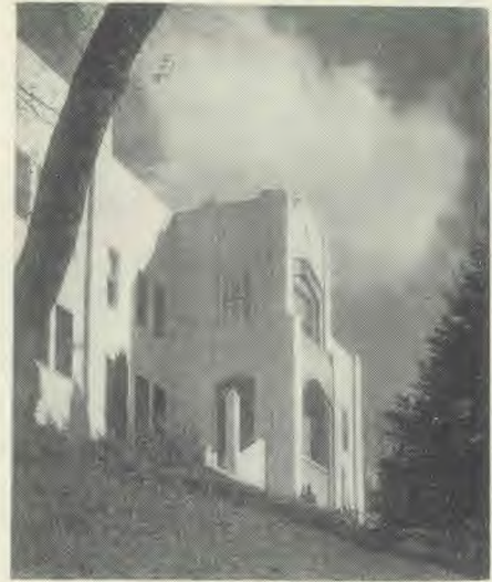
1945 SUMMER SESSION BEGINS JUNE 12

Where Nature and Revelation Unite in Education