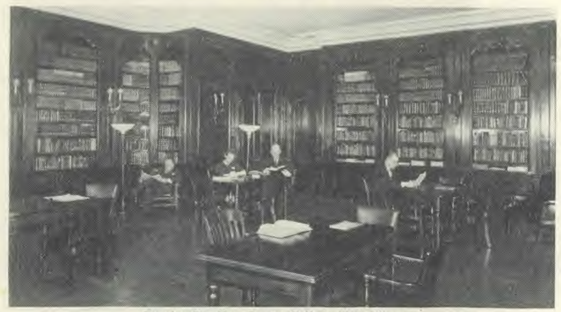
Faculty Reading Room, College Hall Library In the Heart of New England, Rich in the Lore of our Nation and Church

South Lancaster, Massachusetts Founded 1882 Dedicated to the Balanced Development of the Student