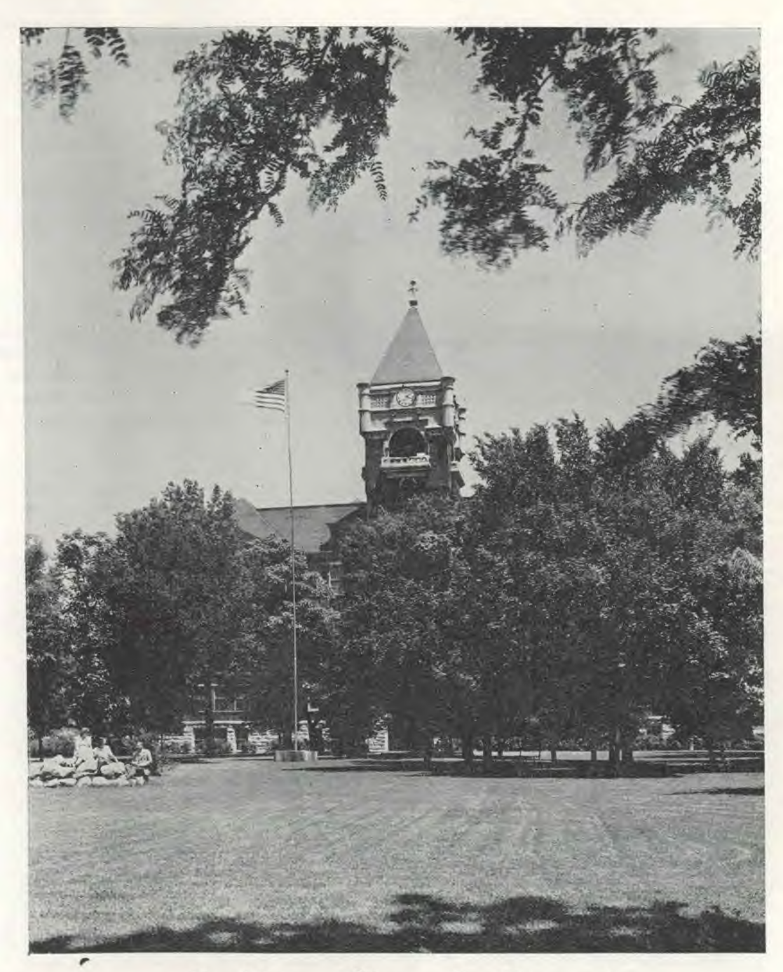
In Union There Is Strength

Old enough to establish a tradition of Christian education for service; young enough to adapt its offerings to the needs of a changing world.