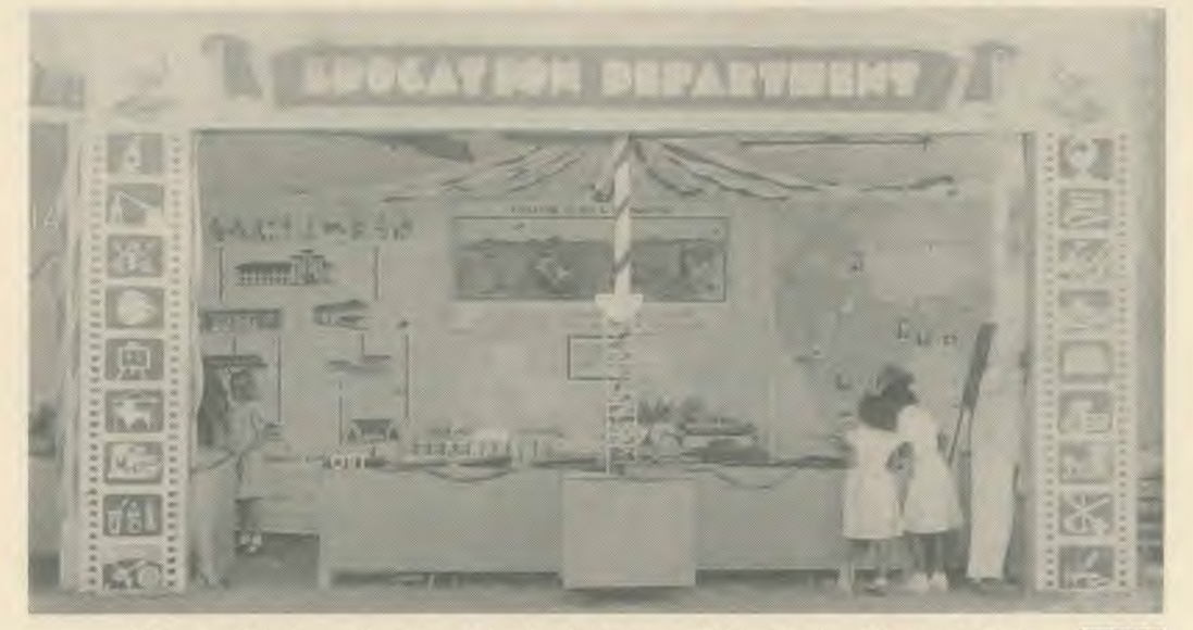
Education Display at Southern Asia Youth Congress Held at Spicer Missionary College, Poona, India, October, 1952.

STUDENTS OF FOREST LAKE ACADEMY (Florida) are 87 per cent active in temperance promotion. One of their projects was placing posters in Orlando city busses; another, placing "jingle boards" along the highway in front of the school which read: "The highway is for civil men—and not for men who drink—because it's only wide enough—for people who can think." These have brought much favorable comment from passers-by.