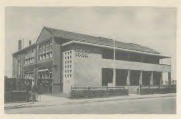
The Hawthorn School, Melbourne, Victoria

Seventh-day Adventists the world around accept the responsibility of conducting schools for the children of the church, with aims and a program built around a Christian philosophy of education. Basic in the program are the following concepts: