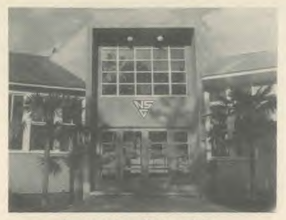
Entrance to Japan Missionary College