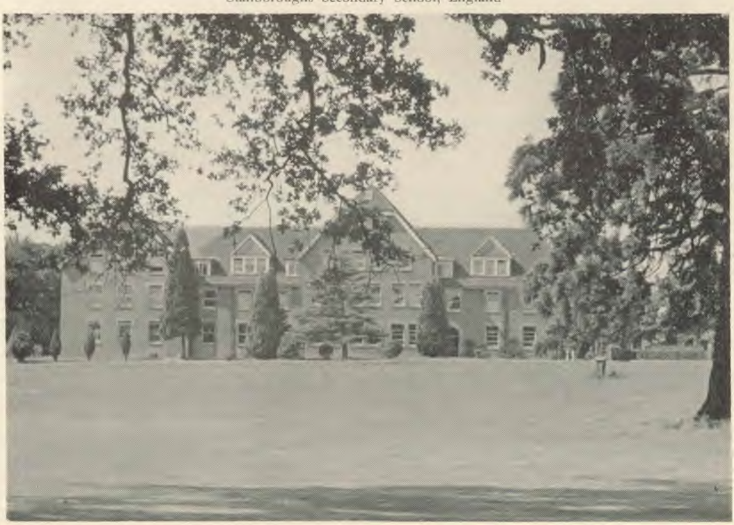
VOL. 17, NO. 1, OCTOBER, 1954