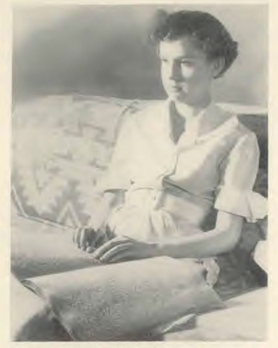
This is a photo of a blind girl. She has lovely eyes but they do not see. Her fingers do her "seeing" for her as she reads her Braille journal.