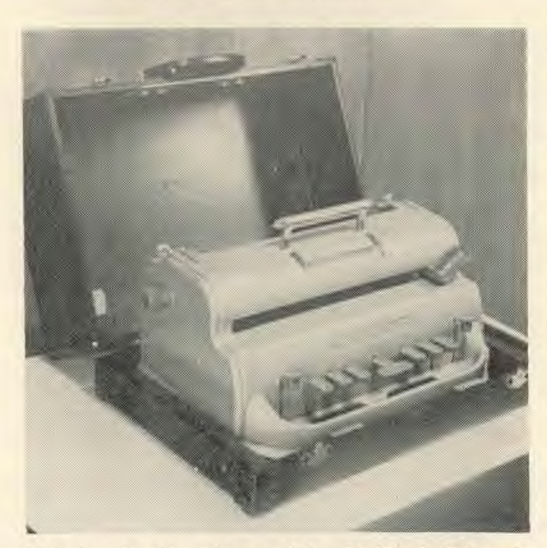
This is a Braille writer used by the blind. It has six keys; each key controls a dot of the Braille cell.