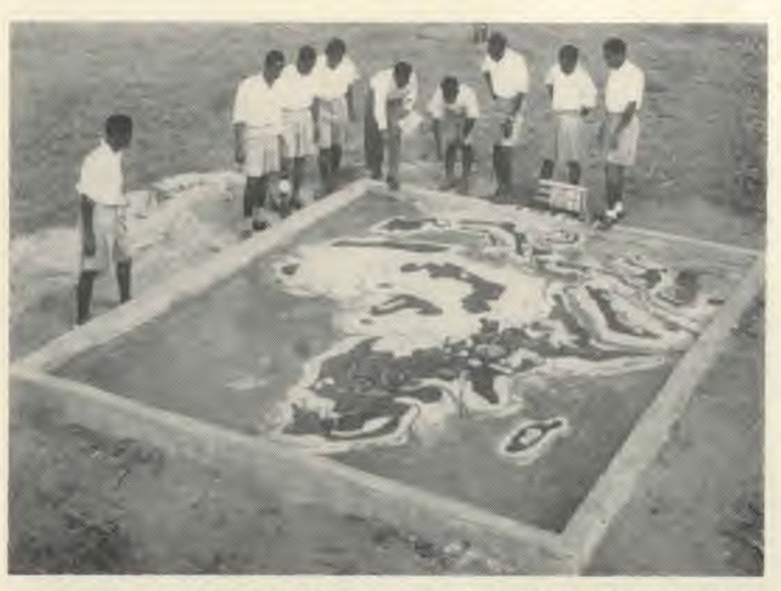
THE JOURNAL OF TRUE EDUCATION

The rest of the construction entailed flooring —Please turn to page 21