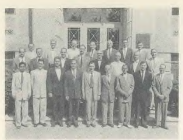
Bible Teachers-Summer, 1956

NOW in its twenty-second year, the Seventhday Adventist Theological Seminary draws an increasing number of students "from all the world" and in turn sends them "into all the world," refreshed by Christian fellowship, confirmed in faith and devotion, built up in the truths of the Advent message, and strengthened in the skills essential to the proclamation of that message.