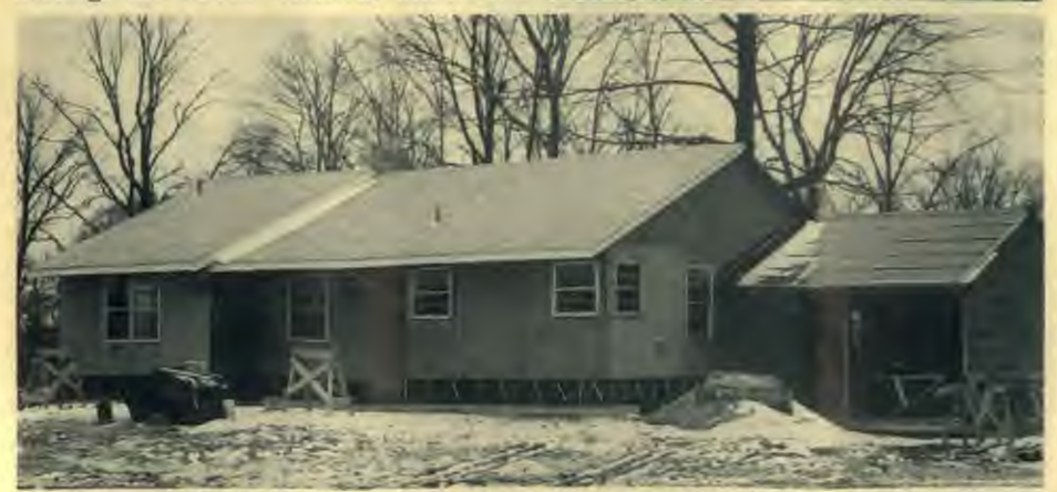
This house is being built by the Building Construction Classes.