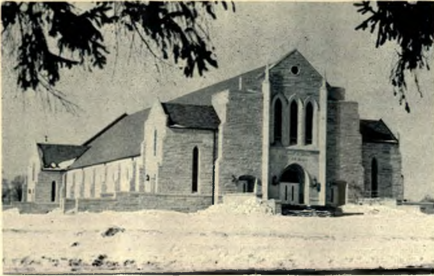
The College Church