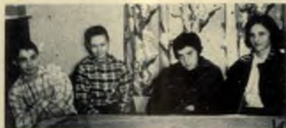
The junior class of the Boggstown church in connection with the Ingathering campaign collected and distributed toys and food for other children less fortunate than they.