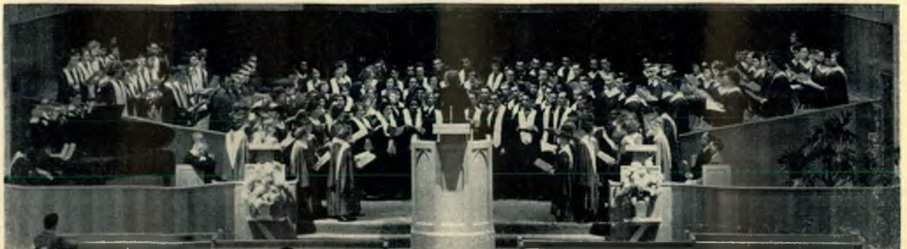
The E.M.C. Choral Union composed of five choirs presented inspiring music.