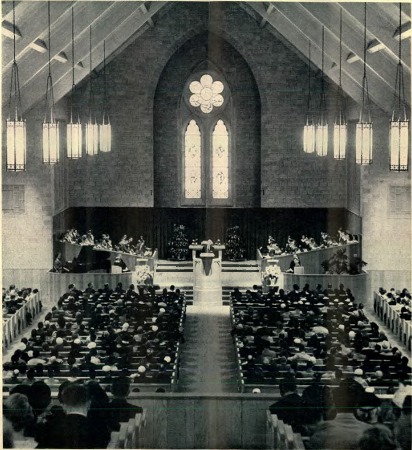
"An House of Prayer for All People"