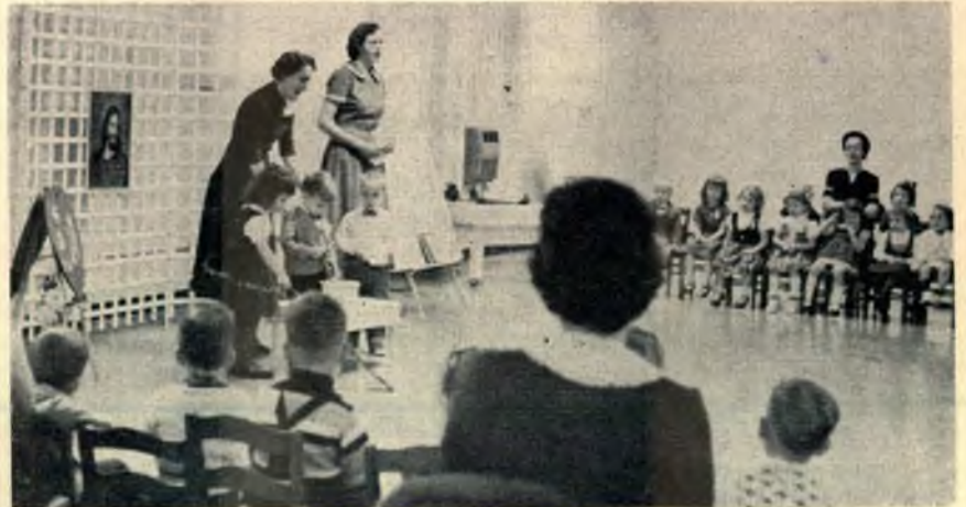
In the cradle roll division, the children helped initiate their new room on the lower floor. Four other rooms are also occupied by children's divisions.