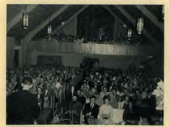
Folding chairs were brought in to handle the overflow audience on one of the peak nights of the Anderson crusade.