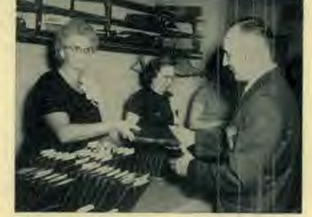
Gift Bibles are distributed each night to those in attendance.

ctures illuminated with black light attendance in this way. When a person elp give added meaning to the music. (See EVANGELISM on page 6) Entered as second-class matter in the Post Office, Berrien Springs, Mich. Printed weekly, 50 mes a year (omitting the weeks of July 4 and December 25) by the College Press, Berrien