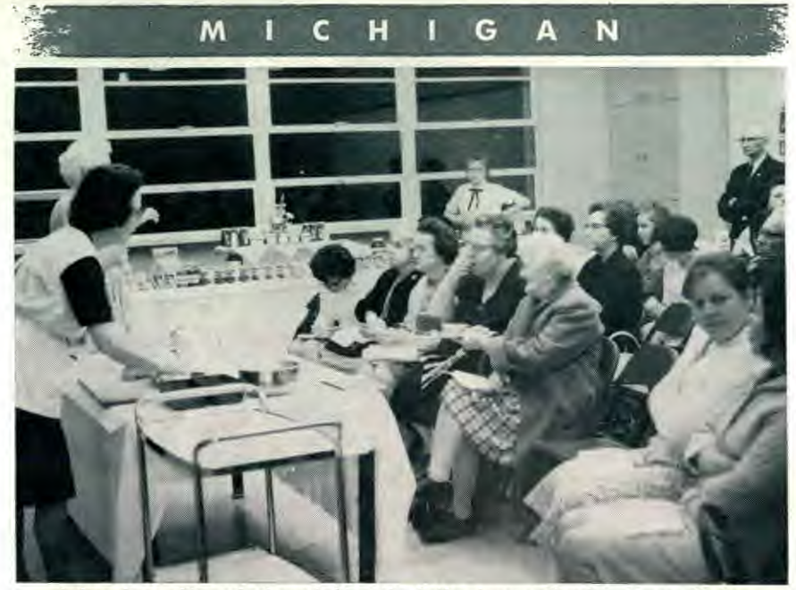
A four-day cooking school was held at the Colfax Avenue Church in Benton Harbor.