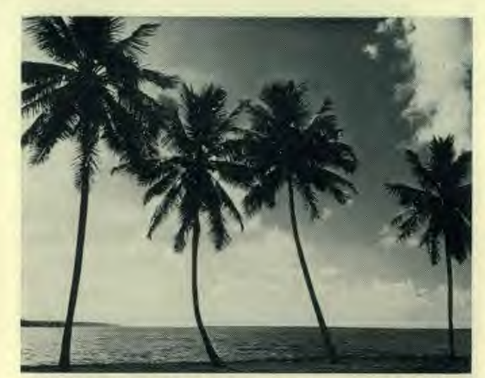
Christmas scenes such as this can be yours if you make the MV trip to Puerto Rico.