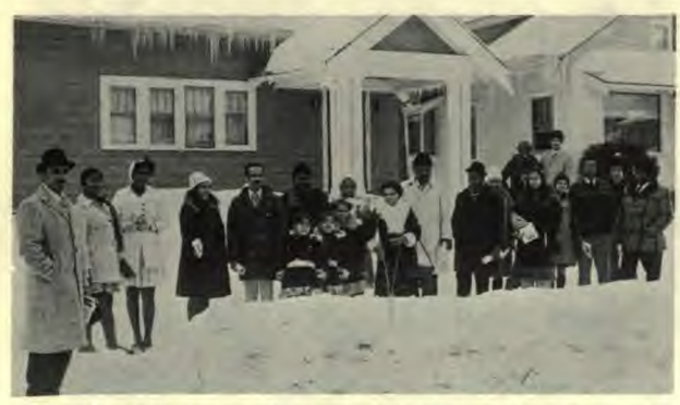
The Spanish group from Central Grand Rapids Church prepares to go out through the neighborhood spreading the gospel of Jesus Christ.