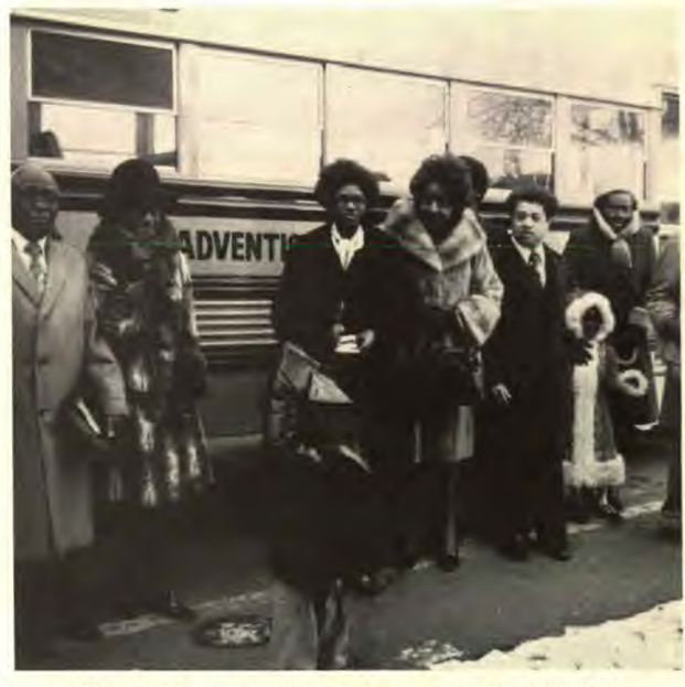
Mizpah Church members take a look at their new bus.