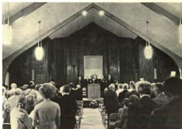
Pictured is the interior of the beautiful new Freeport Church.

demonstration a nurse from the Mossville Caterpillar Plant and a gentleman from the Dunlap Rescue Squad gave the young people their instructions. The club performed the artificial respiration on Resusci-Annie, a dummy designed for this particular demonstration.