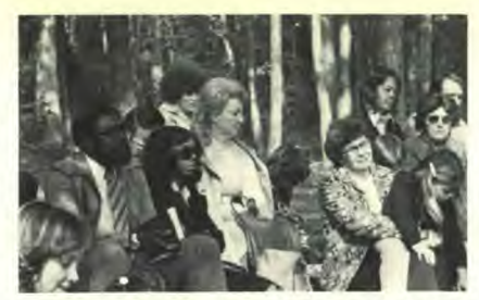
Members of the Champaign-Urbana Church enjoyed services by the lake.

So for the first time, the beautiful setting was used by this church for a