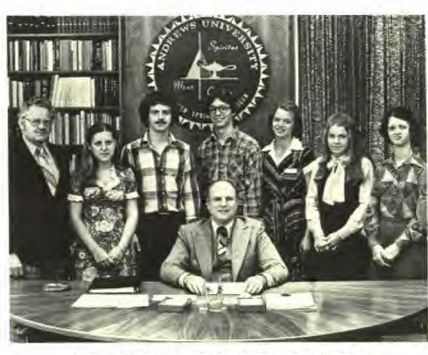
I.A. HONORS STUDENTS VISIT ANDREWS

a night of recreation at the Jewish Community Center playing basketball and volleyball, and swimming.