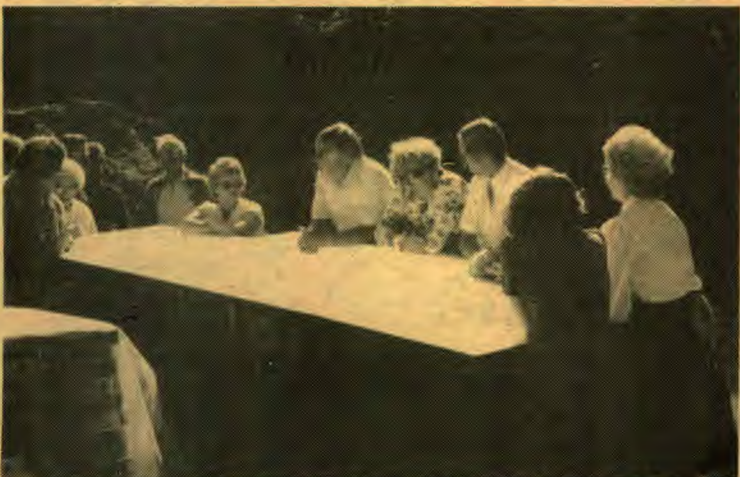
The baptistry was one of the early purchases for the new church at McMillan.