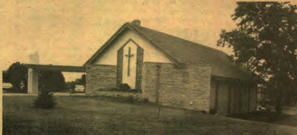
The Freeport Church

ILLINOIS—The Freeport, Illinois, Church was dedicated debt free on Sabbath, August 28. Valued at more than $200,000, the church is located on a 10-acre hillside overlooking the city and seats 200 people.