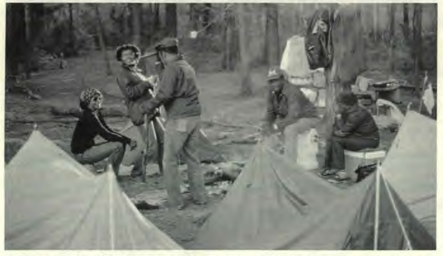
More than 2,000 Pathfinders pitched their tents at the Arrowhead Campground located 15 miles from the city of Atlanta.

The Lake Region Pathfinders totaled 18 clubs, and made their presence felt on Sabbath morning when they marched into the Omni World Congress Center for the posting of the colors. The Pathfinders performed with military precision and with detailed attention to order.