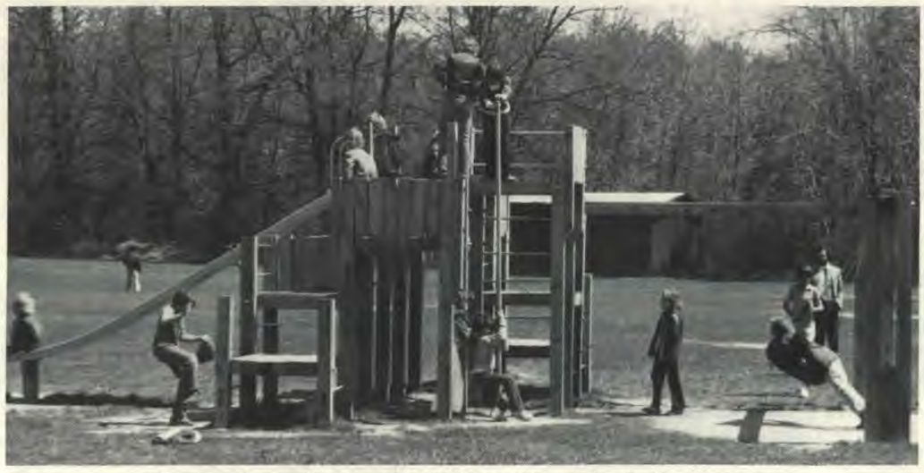
Playtime for students at the Madison, Wisconsin, Junior Academy

I know that Adventist schools are not perfect. Adventist teachers are human and make errors. But I also know that Adventist churches