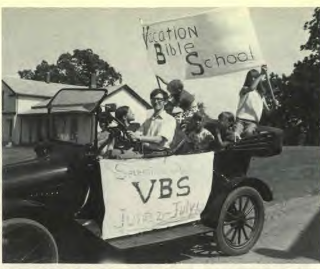
Children at Holly, Michigan, parade through town to invite other children to attend Vacation Bible School.