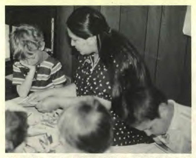
Who knows, maybe one of these children from last year's Vacation Bible School will become a future worker for God.