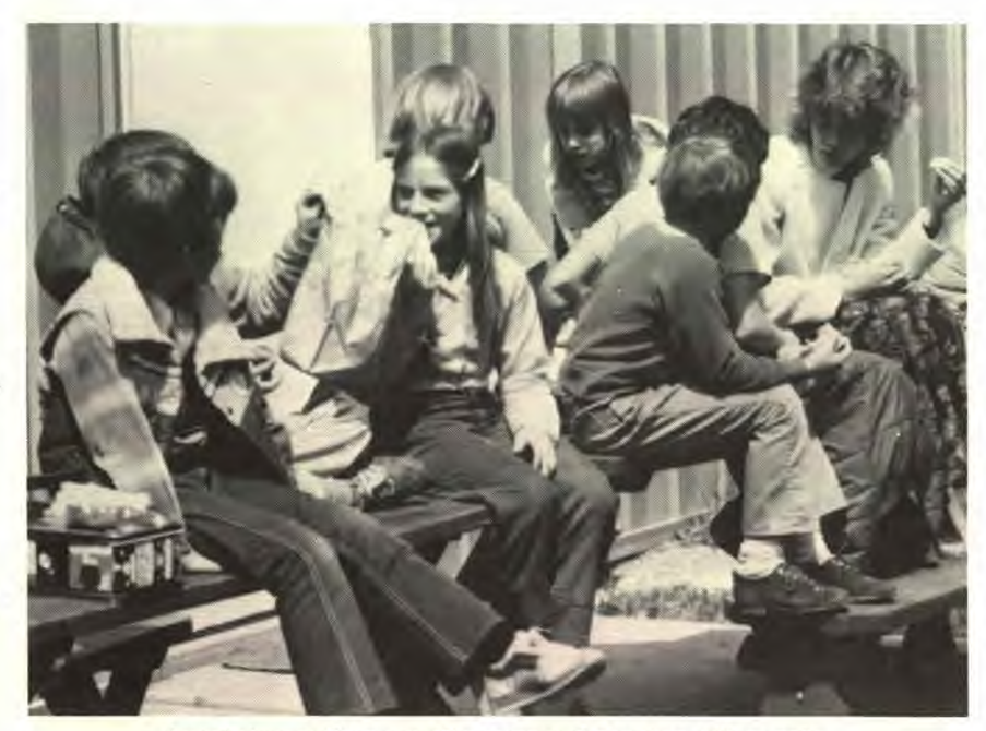
Lunchtime at Petersen Elementary, Columbus, Wisconsin

are eager to operate the kind of schools that will be blessed by God.