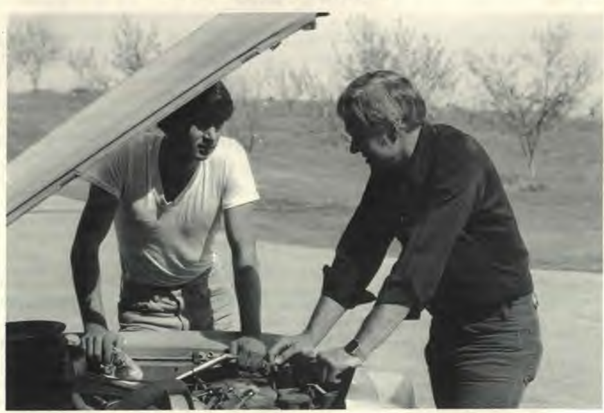
God created fathers to be special and to guide their children aright.