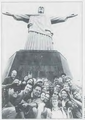
Included in the choir trip schedule in Brazil was a visit to the famous Christo Redentor statue in Rio de Janeiro.

A 10-day concert tour to Brazil gave the Andrews University Singers a lot of reasons to smile. The March 19 to 29 tour meant a spring break of fun, music, and unequaled Brazilian hospitality.