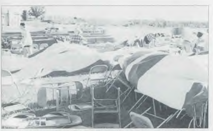
Early Sunday morning, May 31, a strong wind blew down the graduation tent at Great Lakes Adventist Academy.

The wind was so strong that it bent the straight metal tent poles until they looked like the letter "n." It ripped portions of the awning material and brought the tent down to the ground. Chairs and stage materials were scattered, and the electrical power was knocked out. Staff and student volunteers removed the tent and set the chairs and the portable wooden platform in