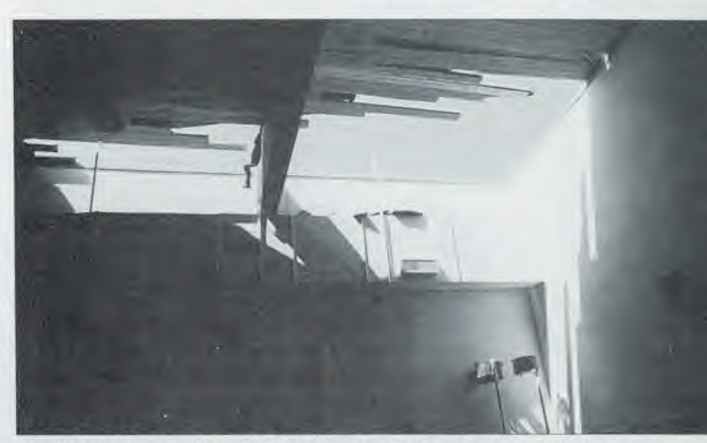
Daylight shines through the holes in the gym roof the morning after the storm. Graduation ceremonies had to be moved to the chapel in the administration building.

Ken Farnsworth, owner of Rhodes International, who hires