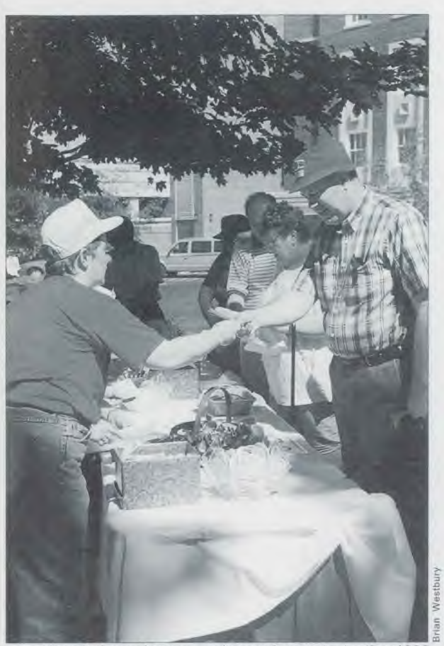
Hospital employees welcomed guests to the 1998 "Cancer Survivors Day" celebration.

health." Hinsdale Hospital believes in sp