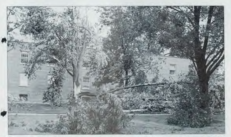
A severe windstorm caused an extensive loss of trees on the Wisconsin Academy campus on graduation day, May 31.

The focus, however, was not on the things that were lost or