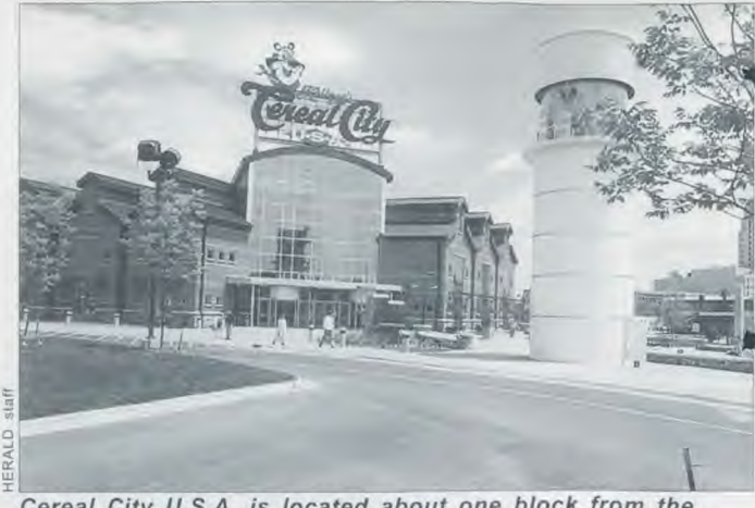
Cereal City U.S.A. is located about one block from the Battle Creek Tabernacle.

Snap, Crackle, and Pop; Tony the Tiger; and Ellen G. White