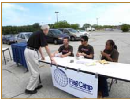
At the Health Expo, volunteers recruited young people to the upcoming FLAG Camp and other events for the community.