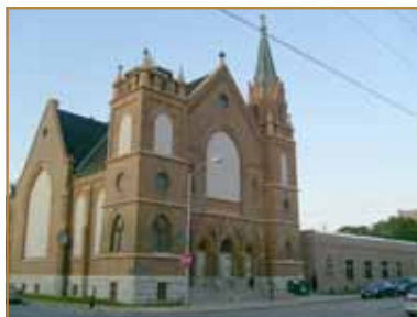
La iglesia del Norte de Milwaukee

La congregación de la Iglesia del Norte en Milwaukee ha visto la dirección de Dios en una forma maravillosa. Después de haber usado por varios años como templo un salón con capacidad para 80 personas, la congregación de aproximadamente 120 personas decidió que era necesario buscar otro lugar porque ya no cabía en ese pequeño e improvisado santuario. Se estudiaron varias opciones, y finalmente se decidió comprar una iglesia vieja pero que tenía capacidad para 450 personas. Se pensó que los cuartos del sótano se podrían acondicionar para clases de niños.