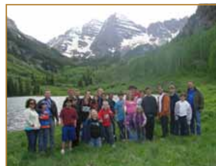
After performing hours of community service in Glenwood Springs, Colo., the Hinsdale Trailblazers Pathfinder club ventured to Aspen to see the Maroon Bells, the most photographed mountain peaks in North America.