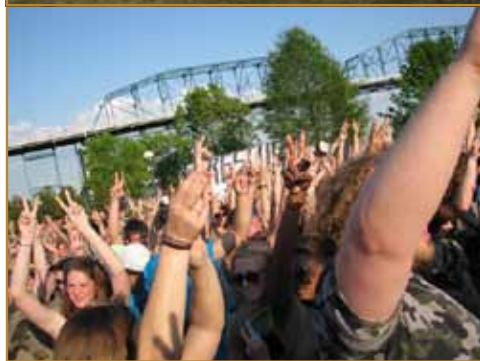
People of all ages, religions, ethnicities and genders gathered for a common goal. ... The overall ambiance gave me the feeling that God was at work there.

tively we understood that although our efforts were going to make a difference, it was going to take something much bigger to make that difference. The overall ambiance gave me the feeling that God was at work there.