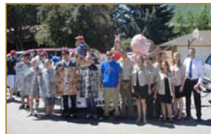
The group participated in the Glenwood Springs Parade on June 11. They also helped another nonprofit organization decorate and create a parade float.