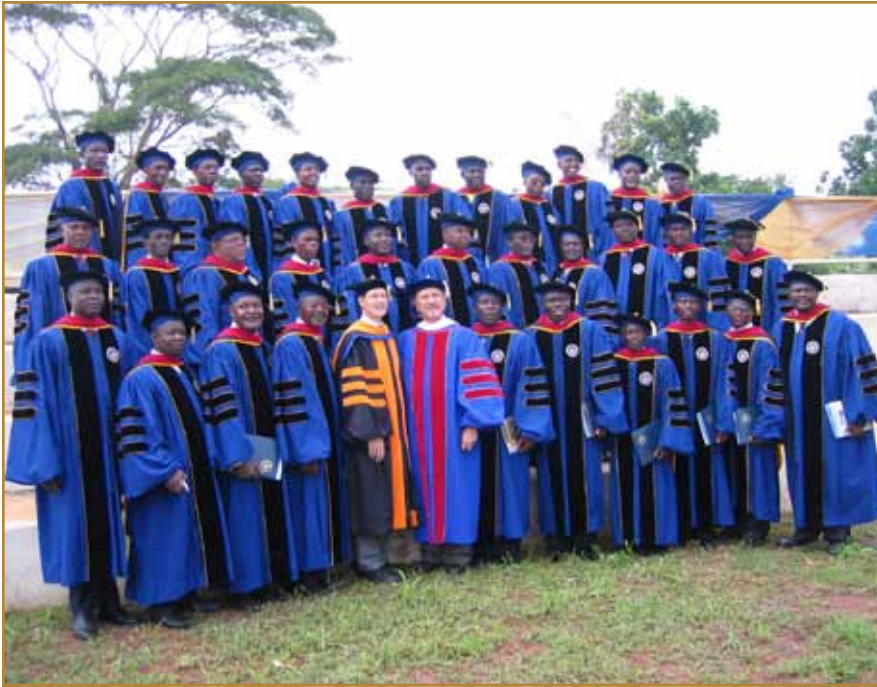
The summer of 2010 marked the graduation of the first Doctor of Ministry students who received a degree from Andrews University's Seventh-day Adventist Theological Seminary, yet completed all of their studies while still in Africa.