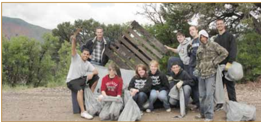
Pathfinders picked up trash along a three-mile stretch of mountain highway near Glenwood Springs, Colo.