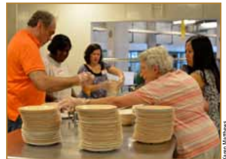
Hinsdale Church volunteers plated food for hundreds of God's hungry children.