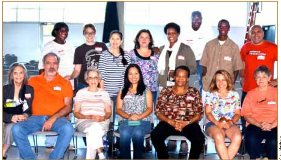
On Aug. 4, volunteers from Hinsdale Church visited Pacific Garden Mission where they assisted those who make a lifework of caring for Chicagoland's homeless. The Mission is funded by individuals, churches, food depositories and organizations.

Why were these Hinsdale Church friends participating in these humble chores when they easily could fill their day with so many timely, personal duties? The responses were heartwarming.