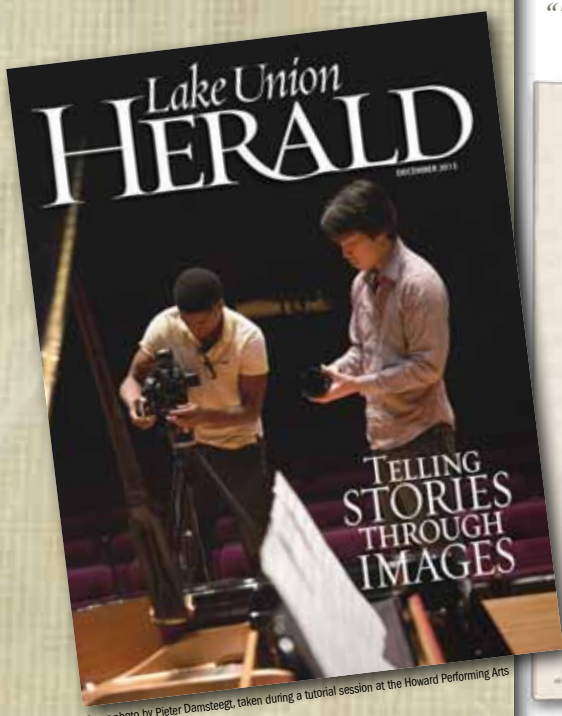
taken during a tutorial session at the Howard Performing Arts Center at Andrews University.

"Telling the stories of what God is doing in the lives of His people"