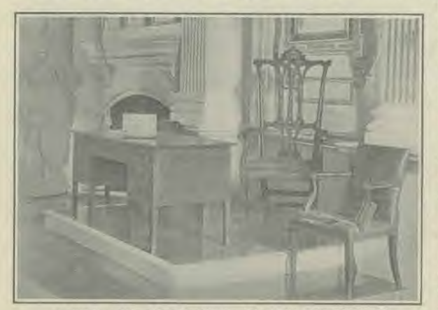
TABLE AND CHAIR USED AT THE SIGNING OF THE DECLARATION OF INDEPENDENCE

True Christian liberty grants to every man the right to think as he pleases in the