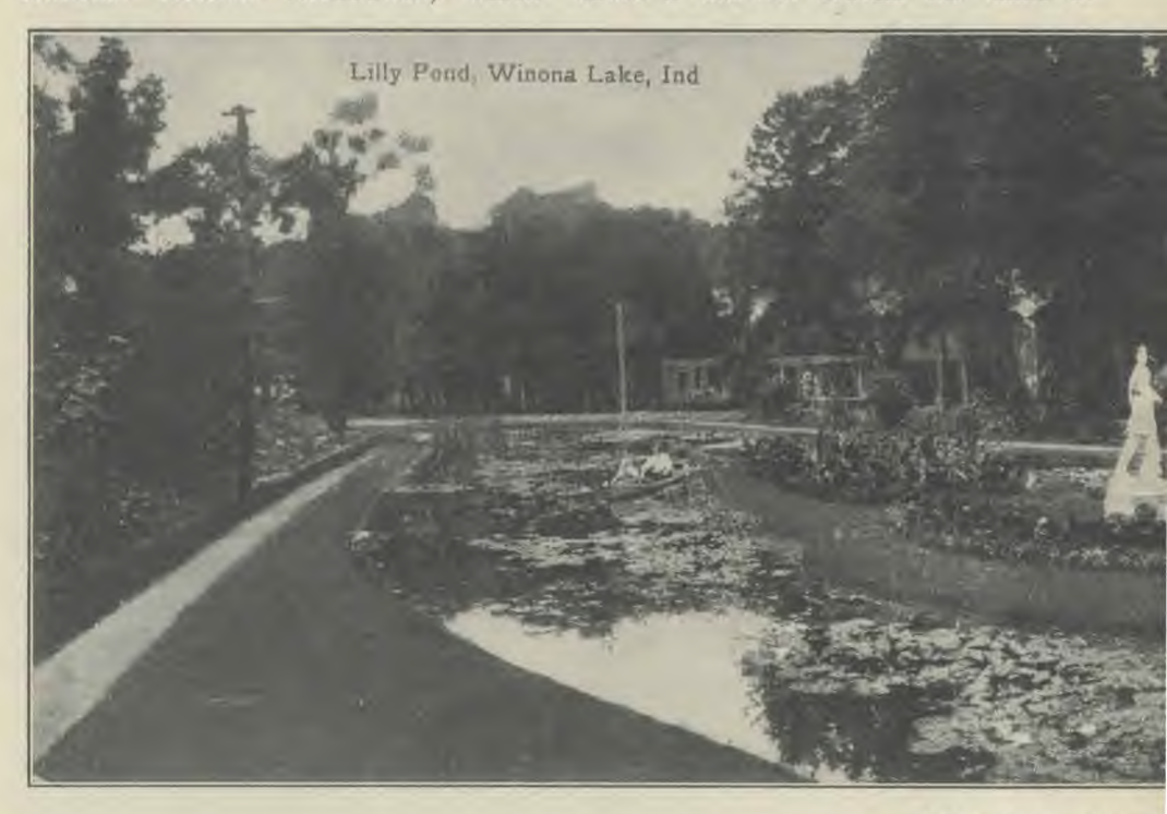
LILY POND, WING

The first address given contained an attack upon the national Constitution because it did not contain the name of