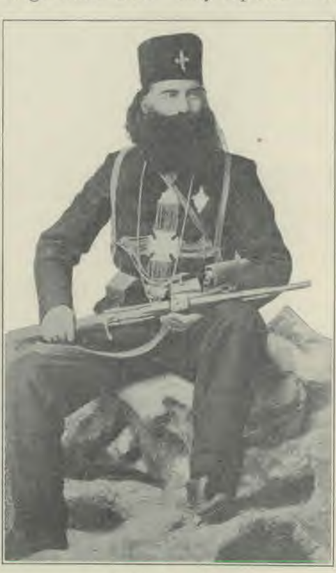
A GREEK PRIEST Leader of a band of Greek soldiers in Macedonia

partment of the king's advisory cabinet was devoted to education and ecclesiastical affairs. Through the secretary of this department the established church makes its appeals for state aid to religious enterprises, for the appointment and removal of leading church functionaries, for the raising or lowering of the salaries of church dignitaries paid by the state, for the approval of decisions made by the Holy Synod when important issues are at stake in ecclesiastical af-