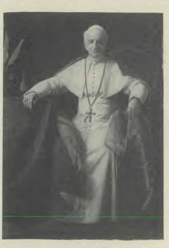
POPE LEO XIII