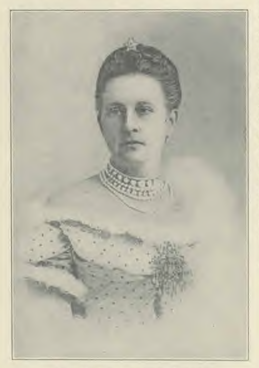
OLGA, QUEEN OF THE GREEKS

Catholic Church, residing at Constantinople, is not only the spiritual head of all Hellenism, but is also invested with political power to represent at the Sublime Porte all the civil interests of the millions of Greeks within the Turkish empire. With the state of unrest and violence that prevails almost continually in the land of the Turk, the patriarch is employed to a greater extent, perhaps, with civil than with religious affairs.