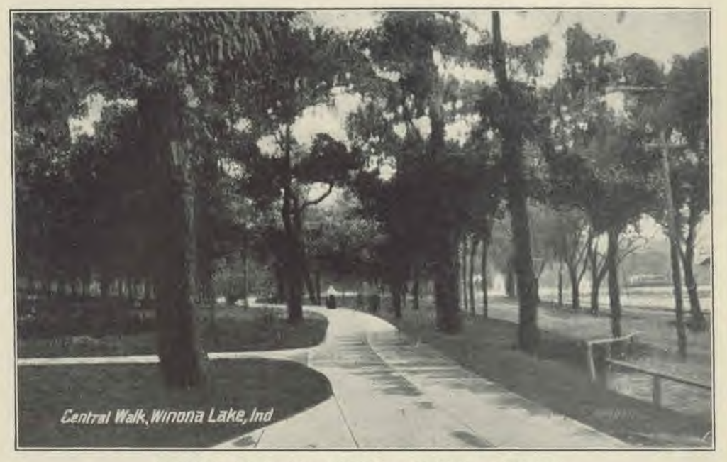
GENERAL VIEW IN WINONA ASSEMBLY GROUNDS

were his agents; and they made him responsible for all they did. They, too, held that the state must "be placed under divine law," and they attempted to place it there; and through their attempt to do that there was created not a paradise but a purgatory. God's spokesmen shall utter his will, said those colonial legislators. They were his spokesmen, they uttered his will (or professed to); and then they placed themselves on the throne of vengeance to execute God's