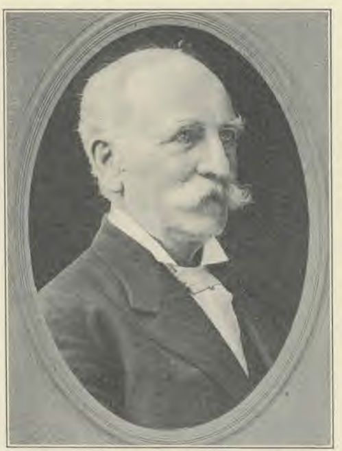
JUDGE SAMUEL STRADLEY, WHO CON-DUCTED THE TRIAL

members of the religious sect that is designated as Seventh-day Adventists make up a good citizenship. Their cardinal idea is to harm no man, and as a class they are honest, sober, diligent, and frugal. . . . The persecution of the Adventist people . . . is a reminder of barbaric ages when fanaticism ruled in councils of state. and set up the gibbet and the stake at every cross-road to vindicate the gospel of lesus Christ through tyranny, pain, mal-