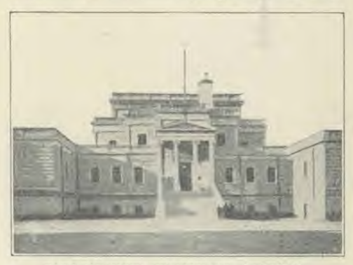
PARLIAMENT HOUSE IN ATHENS

For the maintenance of the perpetual existence of the church, regardless of any