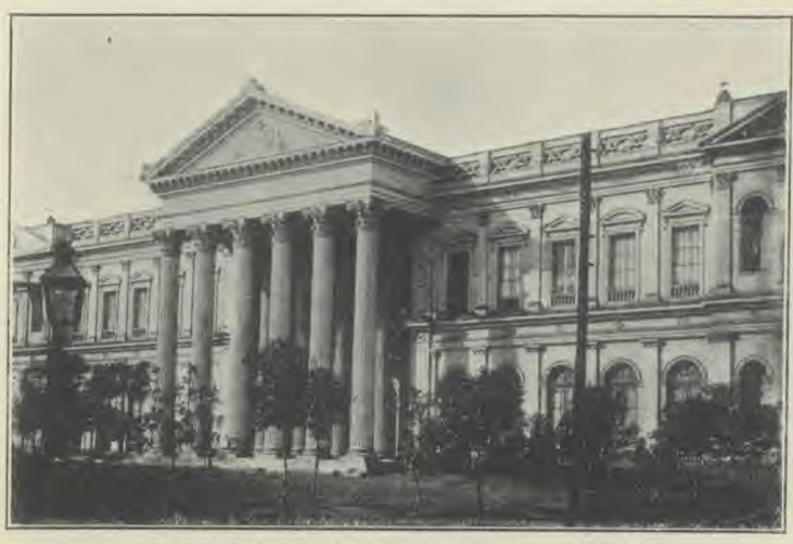
NATIONAL CONGRESS, SANTIAGO, CHILE

I do further declare the doctrine of the Church of England, of the Calvinists, Huguenots, and other Protestants, to be damnable, and those to be damned who will not forsake the same. I do further declare that I will help, assist, and advise all or any of His Holiness' agents, in any place wherever I shall be, and to do my utmost to extirpate the heretical Protestant doctrine, and to destroy all their pretended power, legal