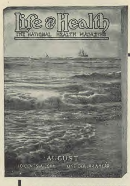
Agents will find LIFE AND HEALTH a good proposition. Many active workers are earning a good living with it. Send for our offer