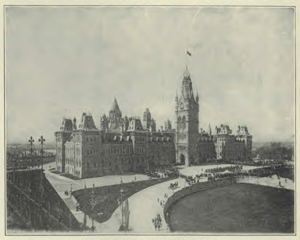
THE DOMINION PARLIAMENT, OTTAWA

Were Rome to obtain control in England through the accession of a Roman Catholic king, there is no question but