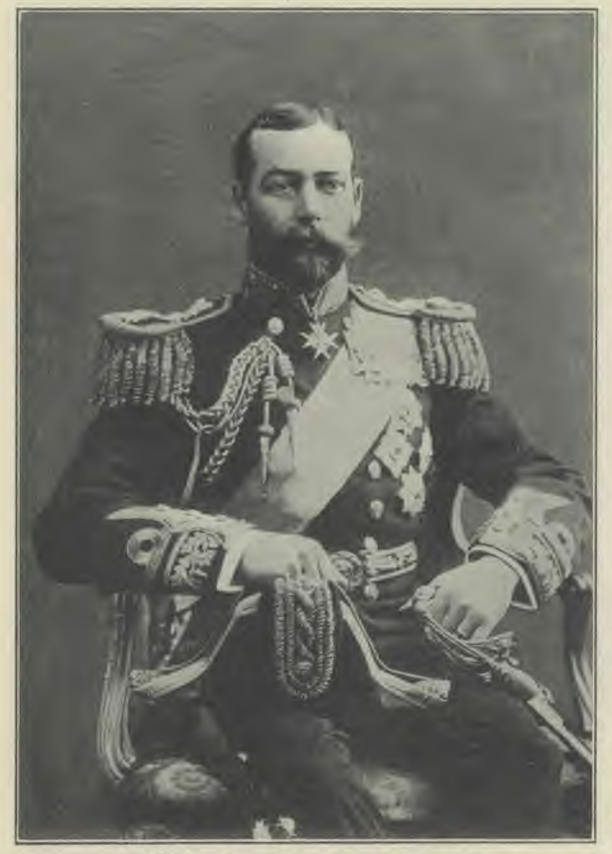
GEORGE V, KING OF ENGLAND

the duty of the Christian citizen to cast his free ballot where it will best promote the highest interests of the Christian sabbath."— San Francisco Morning Call, Sept. 27, 1882.