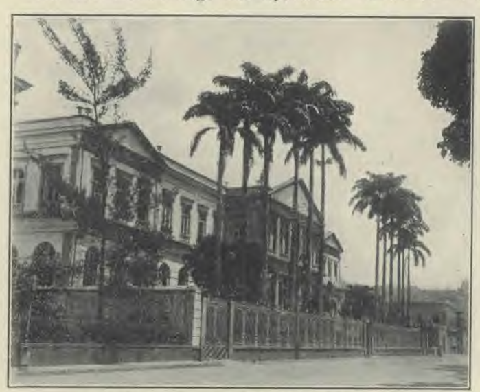
PARLIAMENT OF BRAZIL, RIO DE JANEIRO

same conference, declared that the federation of the churches would mark a distinct step forward toward the realization of that soul-stirring spectacle of a reunited church, marshaled in the unity of the Spirit, to combat and conquer the world for Christ.