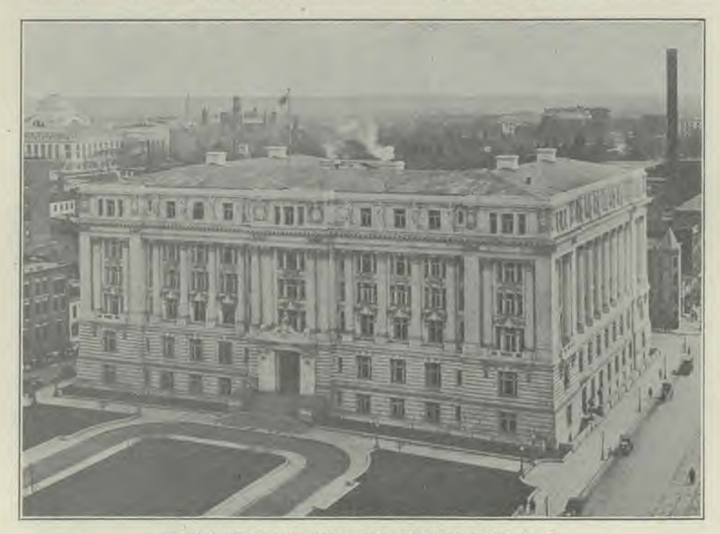
NEW MUNICIPAL BUILDING, WASHINGTON, D. C.

signed this petition, if they are proprietors, can close their shops on Sunday if they wish. There is no law existing compelling them to keep their shops open on that day. If they are journeymen, they are not compelled to work. Every man is free in the matter of contract for labor. He is not under duress, and if he prefers not to work on Sunday, or has religious scruples, he is not com-