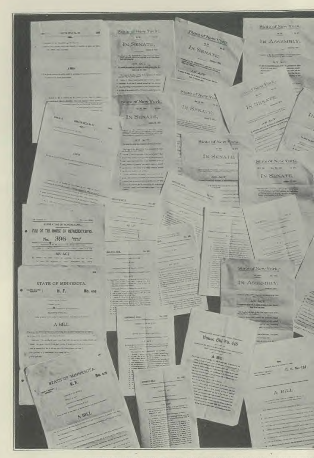
FACSIMILES OF A FEW OF THE MANY SUNDAY BILLS INTRODUCED THIS