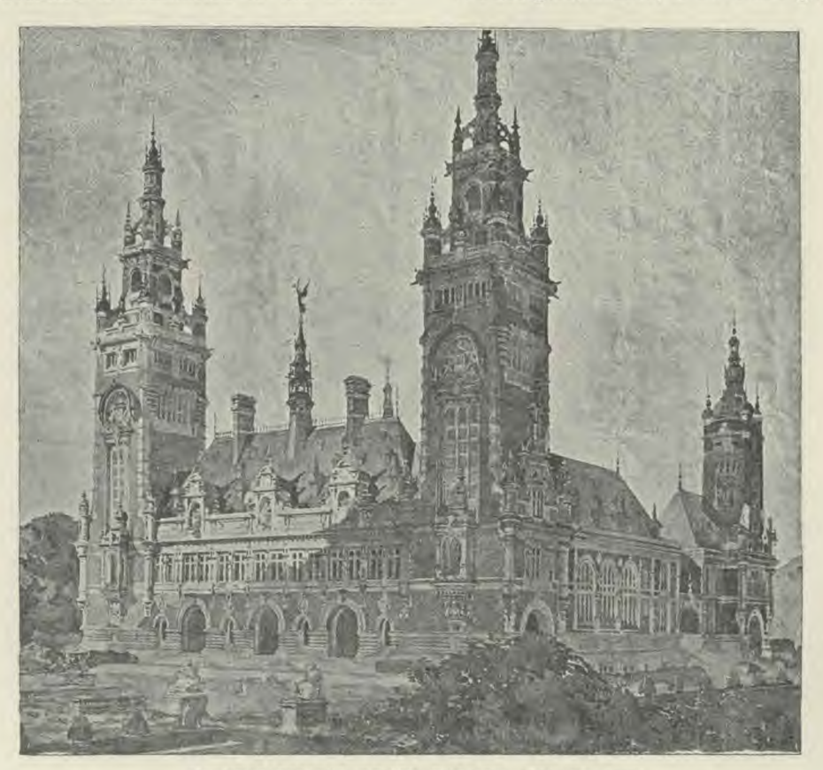
INTERNATIONAL PEACE PALACE, THE HAGUE

of the civil and religious liberty principles of the American Republic. We are in full accord with the sentiment as expressed in the last paragraph of the "Statement," which reads:—