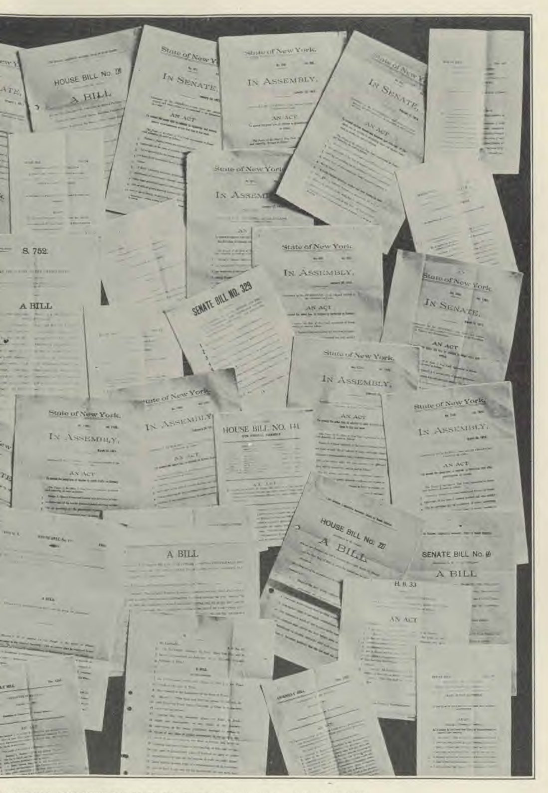
CONGRESS AND THE VARIOUS STATE LEGISLATURES. SEE PAGE 123