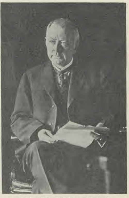
POSTMASTER-GENERAL BURLESON Who recently received over thirty thousand protests from business men

Most of these business men are traveling men who have their mail for the whole week forwarded to a certain town or city where they plan to stop over