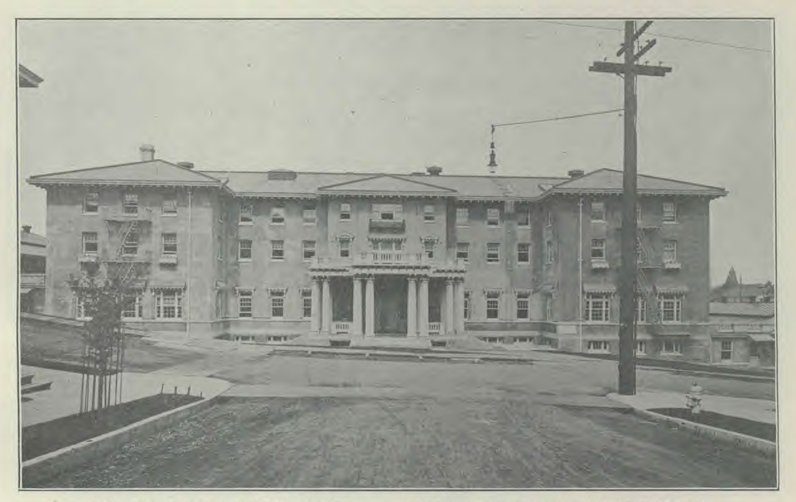
HEADQUARTERS OF THE SECOND WORLD'S CHRISTIAN CITIZENSHIP CONFERENCE, PORTLAND, OREGON